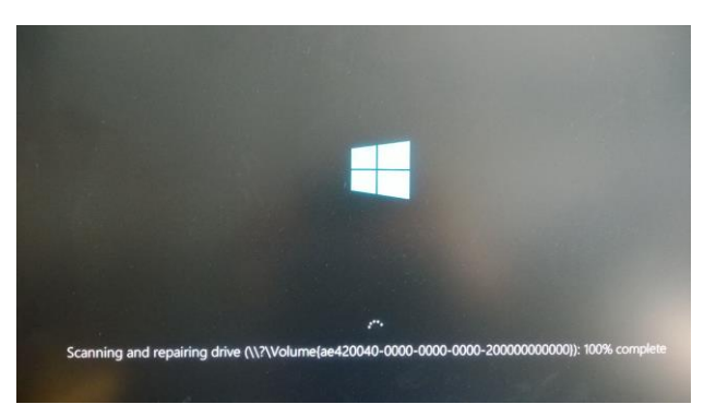
Figure 4 - Disk Check Running

Sudden power-off during OS load on start and shutdown is not a common occurrence. The real concern is under normal operation, when the OS and main application are running. Our final test was to add the Unified Write Filter (UWF). Working with many clients since the release of Windows NT Embedded, we have developed some best practices to help mitigate disk corruption from sudden power loss: