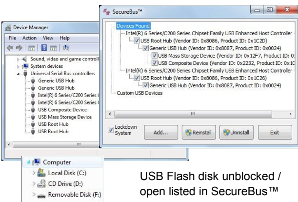
USB Flash disk unblocked / open listed in SecureBus™

A free 14 day trial is available. The trial allows you to test and preconfigure the system. A kit for $399.95 and a per unit runtime license is required for full distribution.